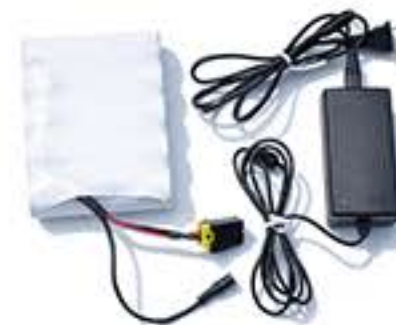
#19176 NI-MH BATTERY PACK & CHARGER • Convenient on-the-go power & charger for 19175 high pressure pump above Case Qty: 6