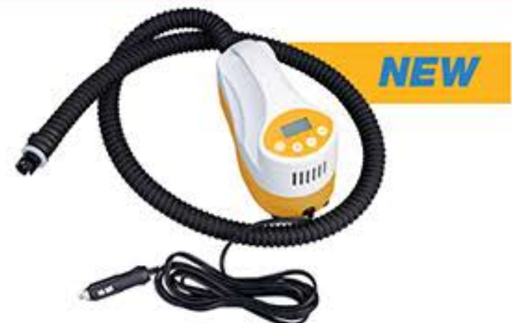
NEW #19177 DIGITAL HPI PUMP • 12 volt (DC) pump 1-16 PSI • Plugs into car/boat accessory outlet • Digital gauge & auto-stop function • Compatible with HR valves only Case Qty: 4