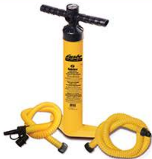
#19135 TURBO DUPLEX HIGH PRESSURE OR HIGH VOLUME PUMP WITH GAUGE • Dual-action high pressure pump • For all Solstice inflatable SUPs, docks & platforms • Universal for all standard H3 valves • Includes second hose for low pressure inflatables Case Qty: 6