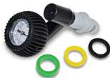
#20086 UNIVERSAL HIGH PRESSURE VALVE ADAPTER • For fabric reinforced & high pressure inflatables • Complete with manometer & adapters Case Qty: 6