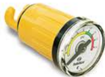
#20087 HIGH PRESSURE VERIFIER GAUGE • Easily & accurately read the exact pressure with your high pressure SUP, boat, or other inflatable • Connects to standard high pressure HR valve Case Qty: 6