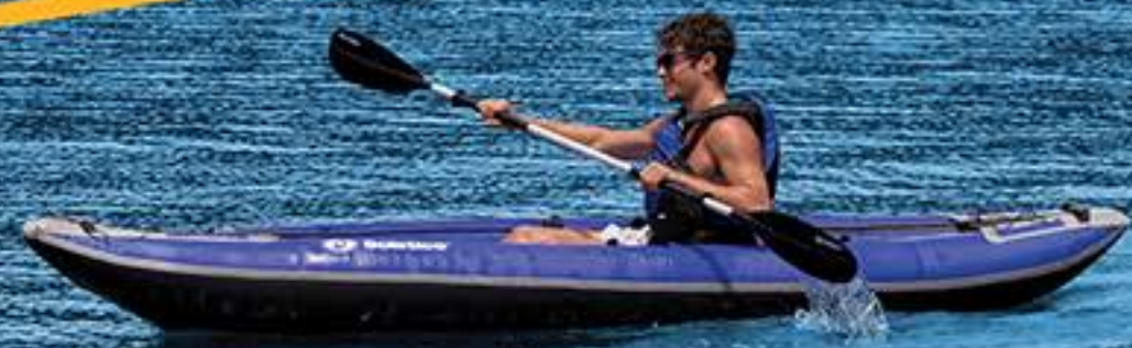
#29635 Durango - Single Configuration