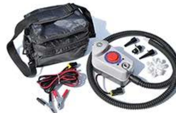
#19175 12 VOLT HIGH PRESSURE PUMP • High performance air pump with nozzle kit, DC battery power cables and carry case Case Qty: 6