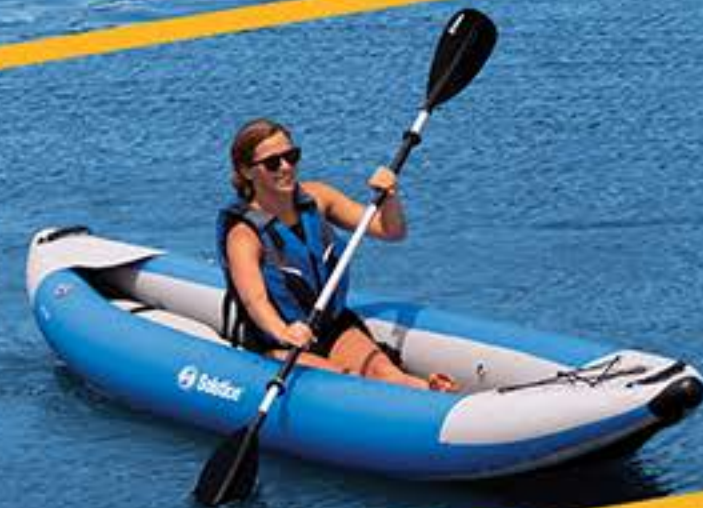
#29625 Flare - Single Configuration