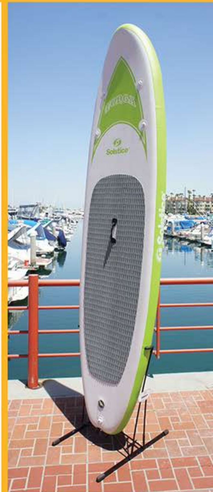
#35999 SUP STORAGE STAND • Keeps your inflatable SUP at ready access Case Qty: 1