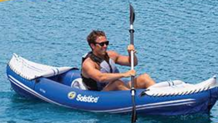
#29900 Rogue - Single Configuration